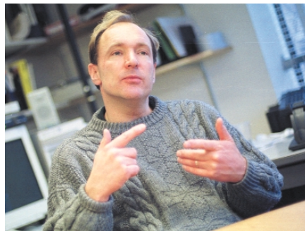
Talking point: Tim Berners-Lee backs more participation from computers in web publishing.

These new products will help users communicate with each other even before a common vocabulary has developed to express the concepts they have in common. The semantic web will provide unifying underlying technologies to allow these concepts to be progressively linked into a universal web of knowledge. Thus it will aid in breaking down the walls of miscommunication, allowing researchers to find and understand products from other scientific disciplines. The very notion of a journal of medicine separate from a journal of bioinformatics, separate from the writings of physicists, chemists, psychologists and even kindergarten teachers, will some day seem as out of date as the